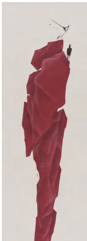
暗香 Faint Fragrance 2018 顏料、墨、彩與紙 Pigment and Chinese ink and colour on paper 160x57cm