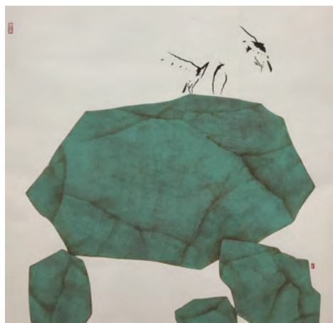
春風和氣 Spring Glee 2019 顏料、墨、彩與紙 Pigment and Chinese ink and colour on paper 95 x 95 cm