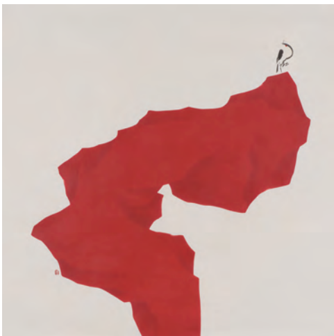
若有若無 Indistinct 2018 顏料、墨、彩與紙 Pigment and Chinese ink and colour on paper 123x123cm