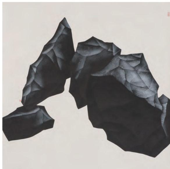
暗石疑藏虎，盤根似臥龍 Behind the Rock in Darkness A Tiger Probably Hides, The Giant Coiling Root Crouches Like A Dragon 2018 顏料、墨與紙 Pigment and Chinese ink on paper 138x138cm