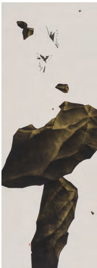
驚雷 A Sudden Clap 2018 顏料、墨、彩與紙 Pigment and Chinese ink and colour on paper 160x57cm