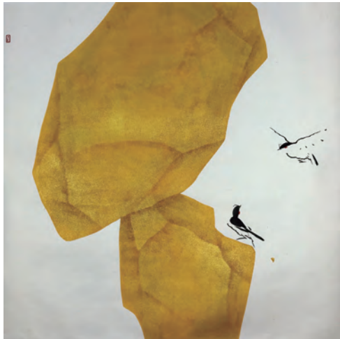
避風港 Safe Haven 2019 顏料、墨、彩與紙 Pigment and Chinese ink and colour on paper 95 x 95 cm