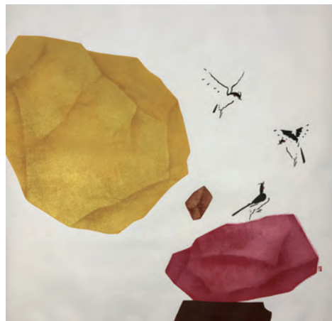
翩翩起舞 A Little Dance 2019 顏料、墨、彩與紙 Pigment and Chinese ink and colour on paper 95 x 95 cm